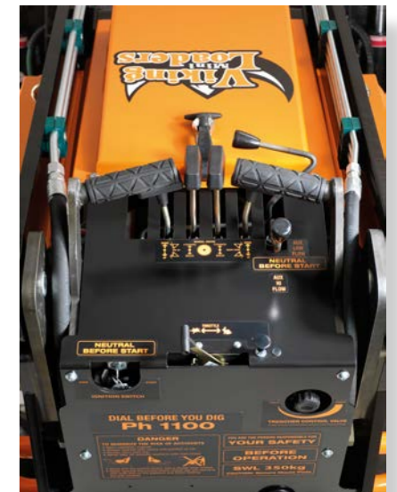
VIKING MINI LOADER WORKMATE CONTROL PANEL